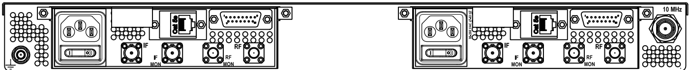
Typical rear panel view - Shown with no options

Frequency aging: 1 \times 10^{-9} per day after 24 hours operation preceded by 10 days of operation